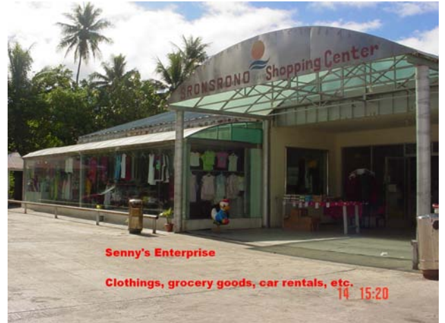
12 GOOD REASONS TO INVEST

A potential exists for assembly or light industrial manufacturing based on a competitive wage level, low electricity costs and several preferential trade agreements allowing good access to the nearby Pacific markets.