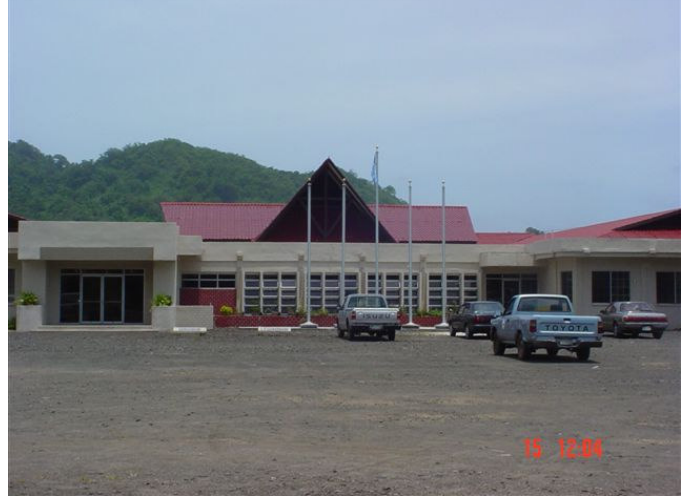
appointed by the Governor, and confirmed by the legislature. All elected officials serve for a term of four years.

K osrae State Government is a constitutional democracy with three branches of government: Executive, Legislative, and Judiciary. The Governor is the highest elected official and directs eight principal departments and offices. The Legislature is comprised of 14 senators elected from the four different municipalities. The Judiciary is headed by a Chief Justice,