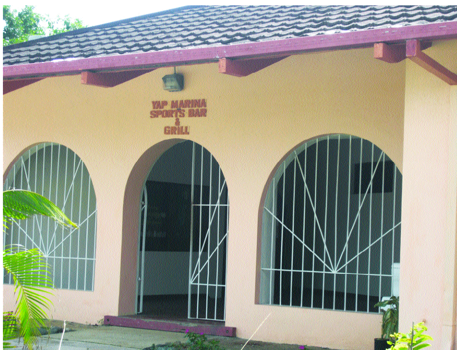
MARINA SPORTS BAR & GRILL