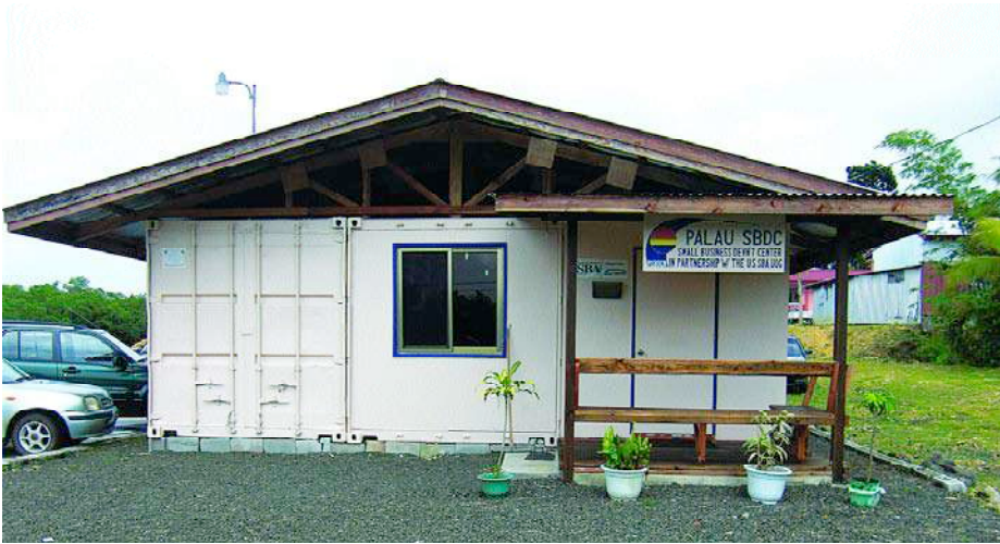
PALAU SBDC'S new look but in the same location.