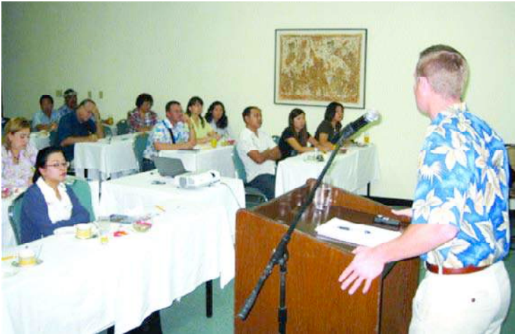
Tourism Training Seminar - Northern Marianas