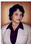
Lourdes "Lou" Leon Guerrero President & CEO Bank of Guam SBA's 2007 Guam Women In Business Champion of the Year

The Guam SBDC is pleased to announce that the two nominees that the SBDC submitted this year for the 2007 SBA Awards both one. The first, Lourdes "Lou" Leon Guerrero, has been a nurse, a former Senator, and now President and CEO of the Bank of Guam. Lourdes "Lou" Leon Guerrero has proven to be a positive role model for women in business on Guam as she is honored as SBA's 2007 Guam Women In Business Champion of the Year.