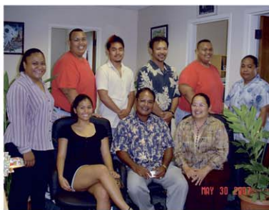
JA student, advisor, SBDC staff and Minister of Education.

curriculum. Students are encouraged to use innovative thinking to learn business skills that support positive attitudes as they explore and enhance their career aspirations. Through a variety of hands-on activities and new technology designed to support varied learning styles, students develop a better understanding of the relationship between what they learn at school and their successful participation in the local economy. JA program meets the after-school programming needs of a diverse group of students by providing engaging, academically challenging, and experiential learning sessions in economic education. The following concepts are presented: company structure