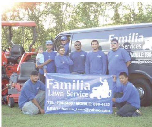
The Familia crew.