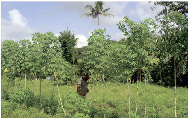
Cassava farm in Aimeilik.