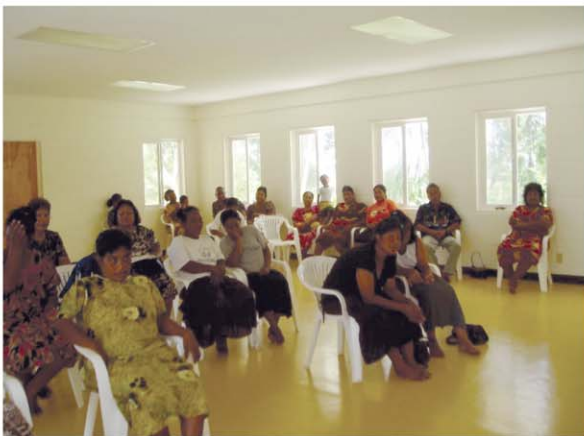
Ajeltake community participates in the joint training offered by the RMI SBDC and Ministry of R&D Trade Division.

The training sessions conducted by the RMI SBDC are open to all potential and existing small business owners. For more information on the RMI Small Business Development Trainings, you may contact the SBDC at (692) 625-3685 or visit the SBDC at the Marshall Development Bank Building 4th Floor Room 404.