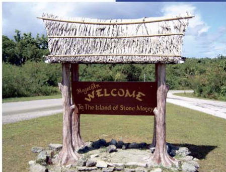
From cultural attractions to traditional events and beyond, key is customer service.